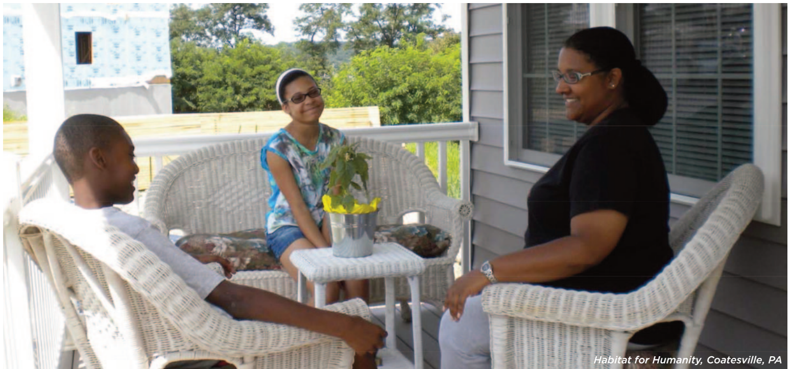
Habitat for Humanity, Coatesville, PA